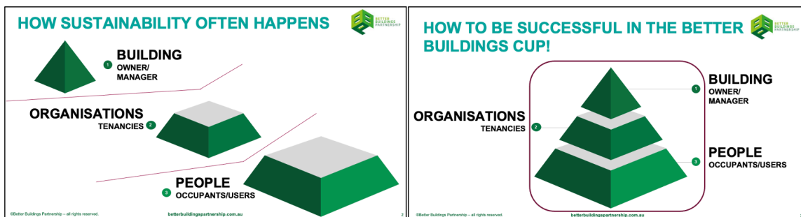
Figure 1: Whole building focus