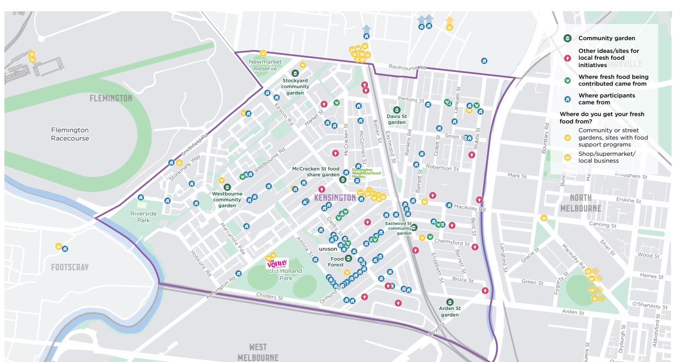
Figure 2. Kensington Neighbourhood - Kensington Community Fresh Food Market Feedback

Making available local referral pathways and additional mechanisms for support. This includes communicating to all project partners these resources in the advent of attendees disclosing the need for additional support.