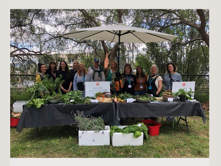
Setting up the first Kensington Community Local Fresh Food Market.

Written by Kensington Neighbourhood House, Living Learning Australia, Transition Town Kensington, Unison and The Venny Inc.